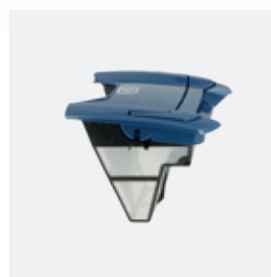
Filter canister (3 L) Debris up to 100µ