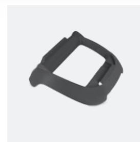
Base For control unit