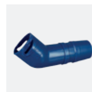
45° extended rotating elbow