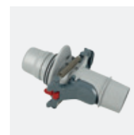
Automatic flow rate adjustment valve (skimmer)