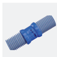
Twist Lock hose