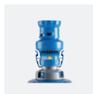
Flow regulator (cleaner)